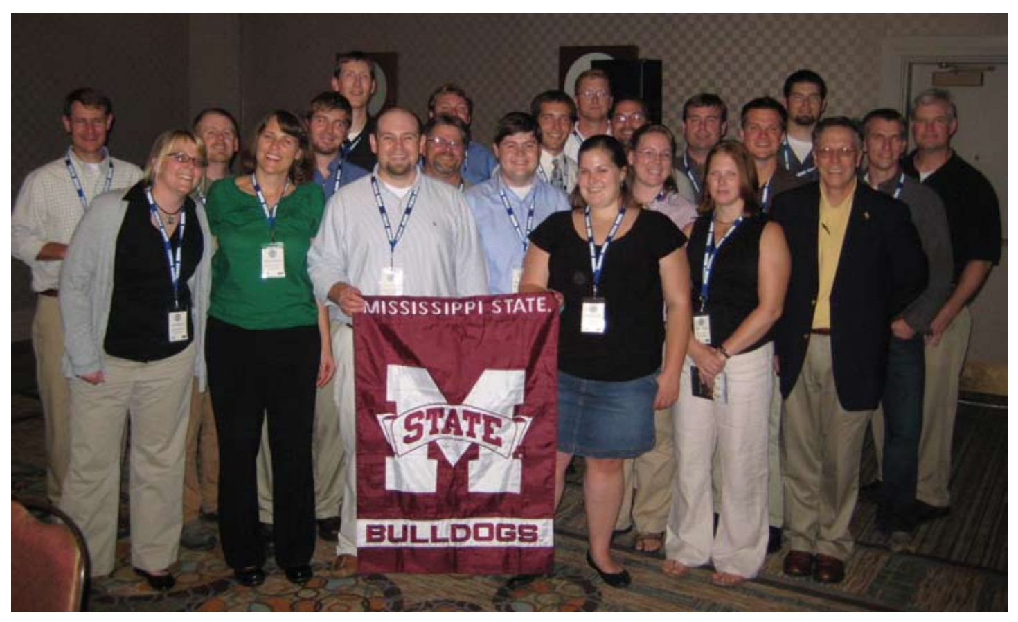
Current and former "Team Duck" MSU students at the 5th North American Duck Symposium in Toronto, Ontario, August 2009

Managing WRP for waterfowl 'I Love Ducks': Students follow migration on cross-country field trip Using your time wisely, at least, if you're a duck... MSU professor and alumni attend wetlands conference Ducks Unlimited honors Mississippi Heroes Of Conservation MSU students and alumni, winners at 5th North American Duck Symposium MSU professor again honored for practical waterfowl research Climate change or not, ducks aren't here Future waterfowl professionals wisit Ducks Unlimited National Headquarters