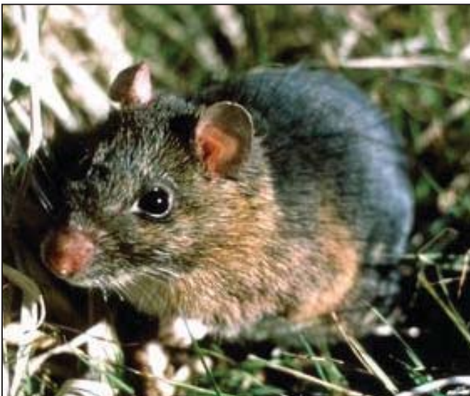
Fig.1. Photo of Neotoma floridana , Riley Co., Kansas.

mexicana , N. micropus , N. nelsoni , N. palatina , N. phenax , and N. stephensi . There are also numerous subspecies of N. floridana (Myers et al. 2008).